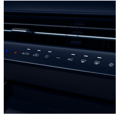
Dual zone automatic air conditioner