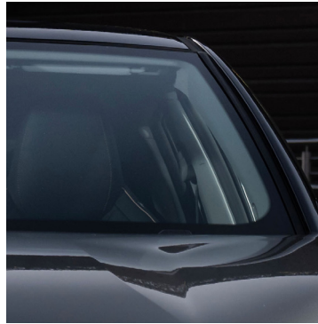
Driver & passenger mute glass