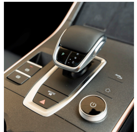
3 Driving Modes (Eco, Normal, Sport)