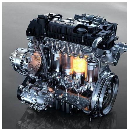
1.5T Engine & DCT Gearbox