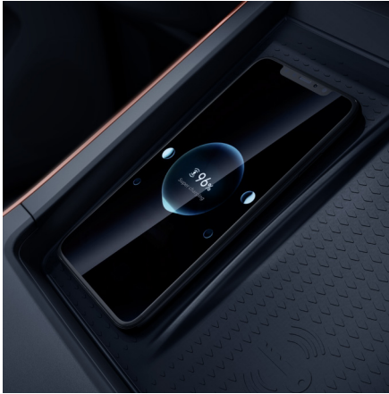
50W Wireless charging dock with air vent