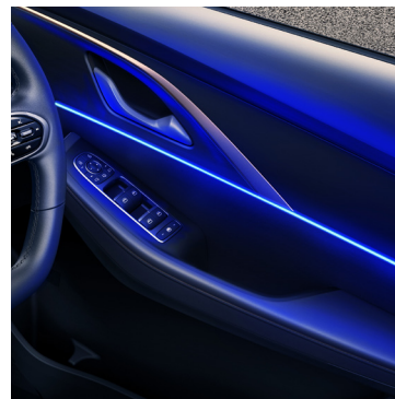
Ambient interior lighting