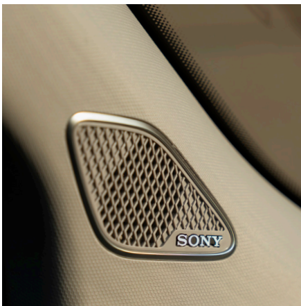
Sony sound system