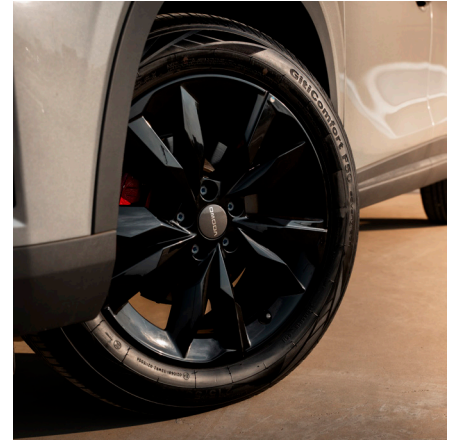
Black Sporty Rims