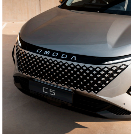
New Elegant Grille