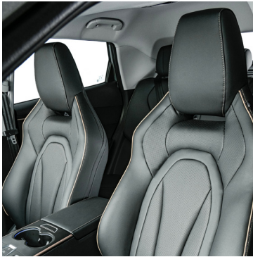
Powered leather sport seats

The C5 X-Series brings together luxury and comfort, delivering a drive that's both polished and relaxing.